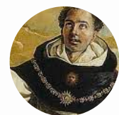
St. Thomas Aquinas

He was the greatest of the Scholastic philosophers, producing a comprehensive synthesis of Christian theology and Aristotelian philosophy that influenced Roman Catholic doctrine for centuries.