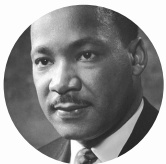
Martin Luther King

MLK is the paragon of what it means to be an 8, harnessing his fire for a worthy cause and refining it in a way that others could receive - only a master 8 could lead a non-violent revolution.